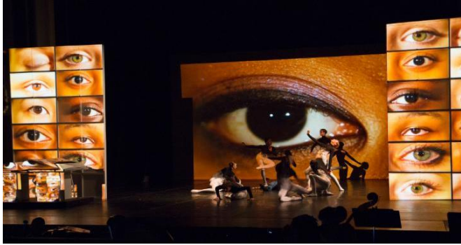
The Codex Project featured spectacular visual effects and projection on three screens and on the dancers and sets themselves.