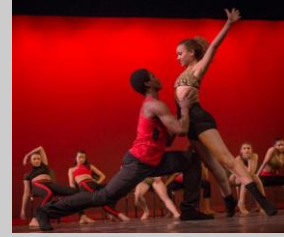
Schaefer Ballroom -Thursday, May 7, 7 pm -Friday, May 8, 5 pm -Saturday, May 9, 1 & 6 pm