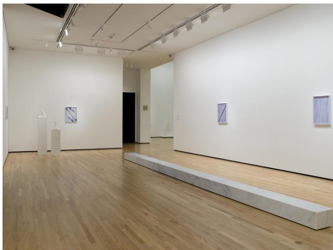
Sara VanDerBeek pays homage to Baltimore.

Alumna Sara VanDerBeek has a solo exhibition of photography and sculpture in the Front Room at the Baltimore Museum of Art . The internationally acclaimed artist's new works are inspired by Baltimore-based dancers, urban architecture, a salvage yard, and the BMA's collection. A series of photographs illuminates fragments of Baltimore architecture shot in the city's neighborhoods and at Second Chance salvage yard. They're paired with images of dance students at the UMBC. The exhibition also features three sculptures, including one created from the white marble typical of the stairs leading up to Baltimore row homes.