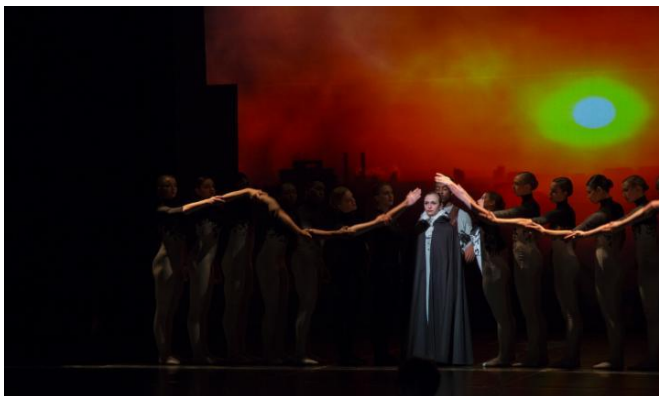
Imagined Worlds featured dancers, instrumental and vocal musicians, visual artists and stage technicians and designers -- All told more than 100 kids from across all grades and disciplines brought the production to life and gained valuable professional experience.